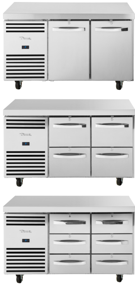
TCR1/2-CL-SS-DL-DR TCR1/2-CL-SS-D2-D2 TCR1/2-CL-SS-D3-D3