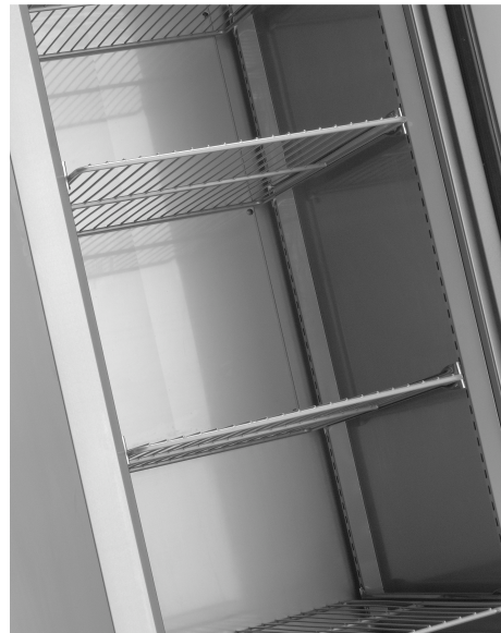
Non-Gastronorm Shelving System With Anti-Tilt Slides

Precision's durable all stainless steel cabinets have been designed to provide commercial caterers with reliable, energy and cost efficient refrigerated storage solutions. Proudly made in the UK, these slimline cabinets are capable of meeting the highest demands of commercial kitchens all around the world - especially when space is at a premium.