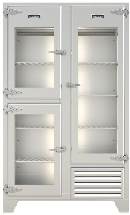
HRU2 - Glass Doors