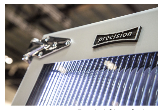
Reeded Glass Option

Give us a RAL number and we'll paint your retro refrigerator to match any colour you can dream of.