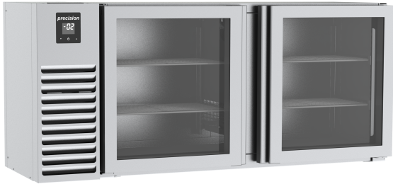
HWU211 (Glass Doors)

Precision's durable all stainless steel GN1/1 wall cabinets have been designed to provide commercial caterers with reliable, energy and cost efficient refrigerated storage solutions when space is at a premium.