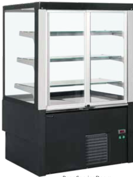
Rear Serving Doors